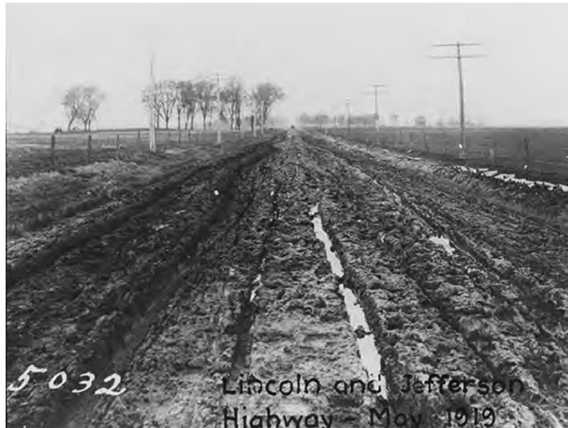
Figure 3. A muddy Lincoln Highway, between Nevada and Colo, Iowa, after a good rain in May, 1919.

to San Francisco. The Lincoln Highway and Route 66 crossed just west of Joliet, Illinois, and, to this day, travel together along a short stretch of roadway (Figure 2).