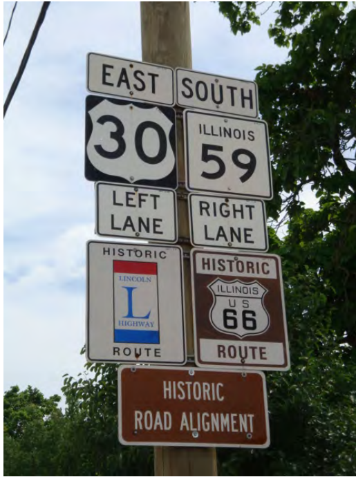
Figure 2. Modern route signs along the Lincoln Highway near Joliet, Illinois.

to San Francisco. The Lincoln Highway and Route 66 crossed just west of Joliet, Illinois, and, to this day, travel together along a short stretch of roadway (Figure 2).