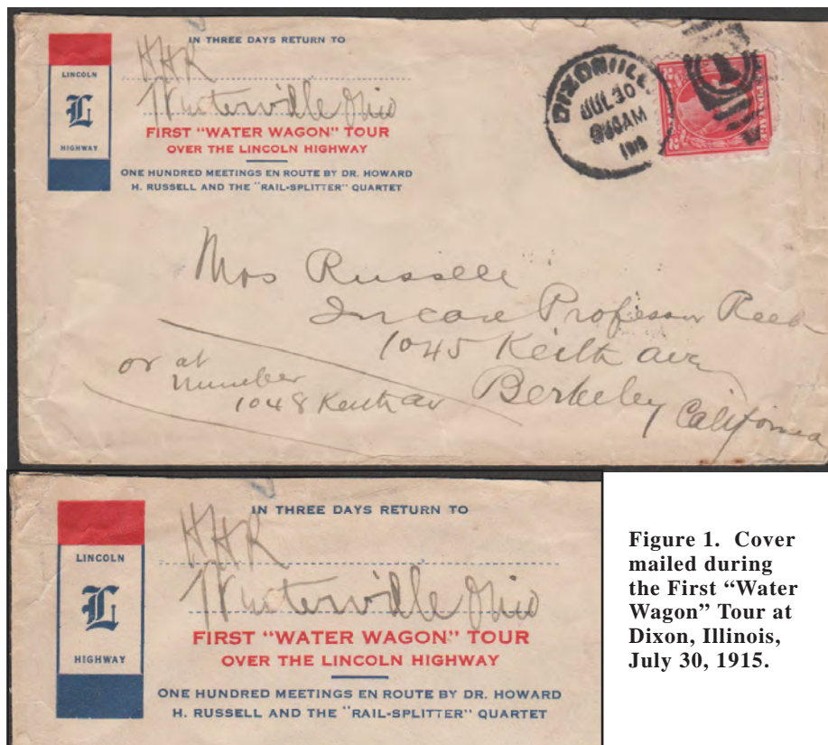
Figure 1. Cover mailed during the First “Water Wagon” Tour at Dixon, Illinois, July 30, 1915.

The cover was mailed at Dixon, Illinois on July 30, 1915. The cornercard of the cover (Figure 1) shows the logo of the Lincoln Highway, which had been dedicated on October 31, 1913. The Lincoln Highway, like Route 66, was well known to Americans in the last century. While not universally known as the subject of a popular song like Route 66 , the Lincoln Highway was the first prominent highway to cross the continent, from New York City